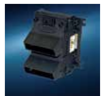
3-way high-speed sorter