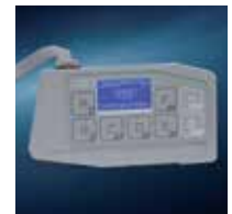
On-site tool HENRI+