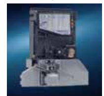
3-way sorter standard